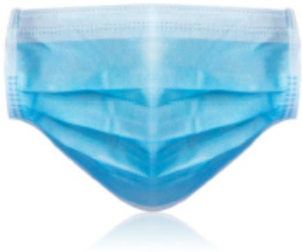
Disposable Medical Face Mask 一次性防护口罩